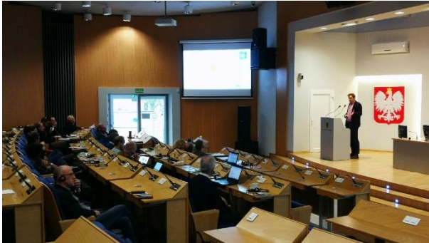
Final EuroVelo 10 – Baltic Sea Cycle Route Biking South Baltic! Project meeting in Gdansk

new bookable offers packages for this route, the installation of new signing along EuroVelo 3 in Belgium and parts of Denmark and France and a detailed survey of the route that led to the publication of the Transnational Action Plan .