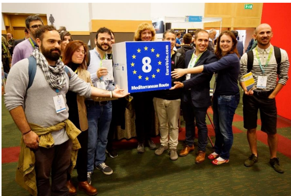
EuroVelo 8 – Mediterranean route web launch event at Velo-city Dublin

Three more EuroVelo projects were ongoing in 2019: the EuroVelo 1 – Atlantic Coast Route AtlanticOnBike Project, the EuroVelo 8 – Mediterranean Route MEDCYCLETOUR Project, and the ECO-CICLE project that aims to improve natural and cultural heritage policies by creating a European network for the promotion of cycle tourism in natural areas.