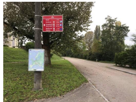
EuroVelo map panel installed in Basel, Switzerland

In Spain , new signing was installed in Catalonia in the frame of the MEDCYCLETOUR Project's pilot actions. The autonomous community of Valencia also joined the movement initiated by this project as the Valencian government announced plans to invest 10.9 million euros during two phases to fully develop this part of the Mediterranean Route. The first phase had an investment of 4.7 million euros and was expected to be operational by 2020. More information available here .