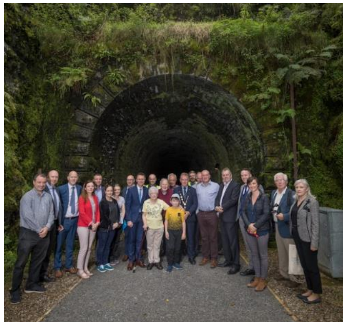
Re-opening of Barnagh Tunnel in Limerick, Ireland

The Irish NECC reported the completion of the Dublin to Athlone section of EuroVelo 2 – Capitals Route in Ireland . Improvement works were also done on the Great Southern Trail Greenway which is part of EuroVelo 1 – Atlantic Coast Route. This included the refurbishment of Barnagh Tunnel in Limerick, which re-opened to the public in September.