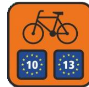
Example of signing in Poland