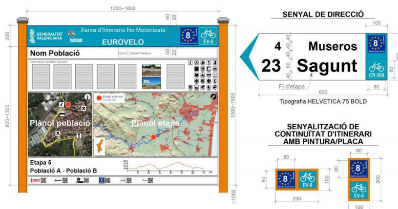
Signing in Valencia, Spain

In Spain , new signing was installed in Catalonia in the frame of the MEDCYCLETOUR Project's pilot actions. The autonomous community of Valencia also joined the movement initiated by this project as the Valencian government announced plans to invest 10.9 million euros during two phases to fully develop this part of the Mediterranean Route. The first phase had an investment of 4.7 million euros and was expected to be operational by 2020. More information available here .