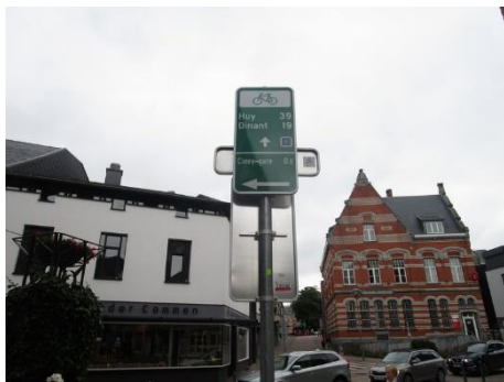
EuroVelo 5 sign in Ciney, Belgium

Hungarian NECC reported that several developments were underway with regards to signing (but also marketing and communications) in Hungary during the year. In Ireland , new EuroVelo signs were installed in Wexford, covering a 120km stretch along EuroVelo 1 – Atlantic Coast Route. In Switzerland , A new information panel for EuroVelo routes, featuring the map of the network, was installed near Basel, on the itinerary of EuroVelo 6 – Atlantic-Black Sea and EuroVelo 15 – Rhine Cycle Route.