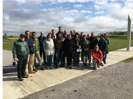
EuroVelo 3 – Pilgrims Route COSME Project partners in Jelling, Denmark

In the 'Biking South Baltic' project, partners have sought to develop EuroVelo 10 – Baltic Sea Cycle Route as a cross-border, sustainable, well-recognised cycle tourism product utilising the natural and cultural tourist resources of the South Baltic coastal regions . During the project, the partners have gained an understanding of the current status of the southern section of EuroVelo 10 by undertaking a detailed survey of the route , using the European Certification Standard methodology developed by the ECF, and undertaken an extensive user survey, utilising both counters, which were also installed as part of the project, and detailed questionnaires. This information was used to develop a long-term strategy (to 2030) for the whole route .