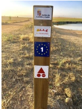
EuroVelo 1 sign in Castile and León, Spain

New signing was also installed along EuroVelo 8 in Oltrepò Mantovano ( Italy ), Croatia and Greece in the frame of the MEDCYCLETOUR project, and along EuroVelo 10 – Baltic Sea Cycle Route and EuroVelo 13 – Iron Curtain Trail in Poland connected to the BikingSouthBaltic! Project.